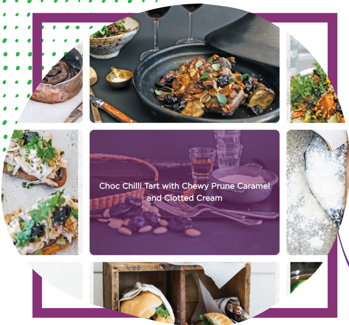
Choc Chilli Tart with Chewy Prune Caramel and Clotted Cream